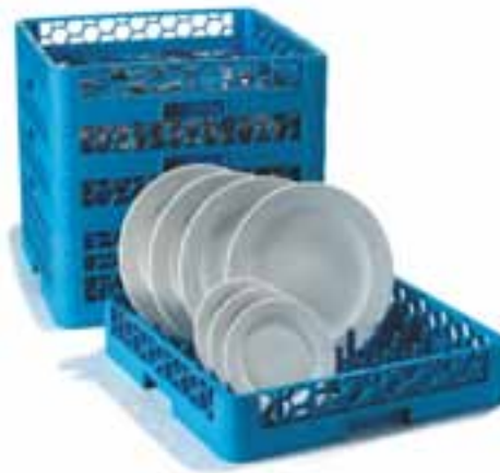
Plate Rack Flatware Rack Open Bowl Rack Compartment Glass Rack Compartment Glass Rack, one Extender Compartment Glass Rack, two Extenders Compartment Glass Rack, three Extenders Compartment Glass Rack, four Extenders Divided Extender Open Extender