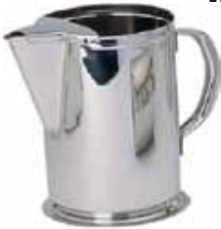
Water Pitcher MA 93010