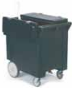
IC2220 200 LB Capacity